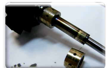
The blue colouring indicates excessive temperatures