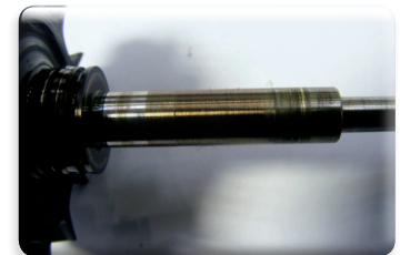
Extreme heat damage due to lack of oil