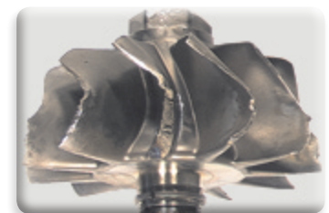
Turbine blade fracture