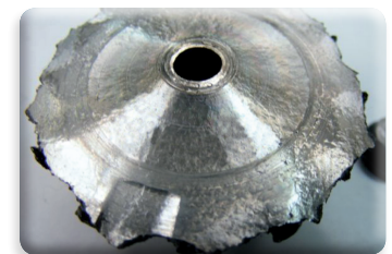
Orange Peel effect on backface